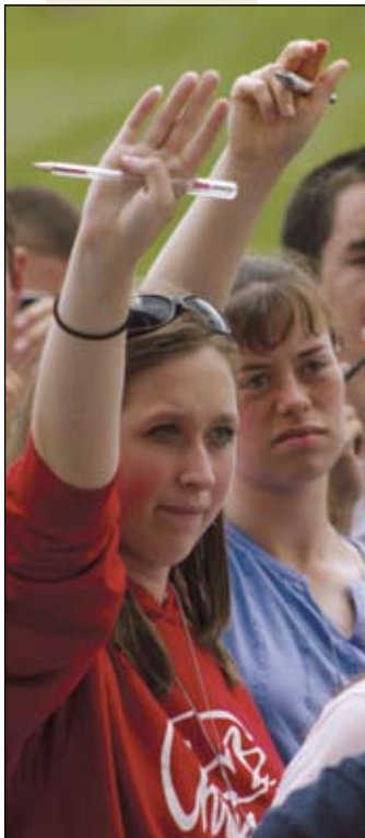
Campers ask questions during a mock press conference during Journalism camp.

The College will release more information on the project, including broadcast schedules, as it becomes available. In the meantime, please pray for the successful completion of this project.