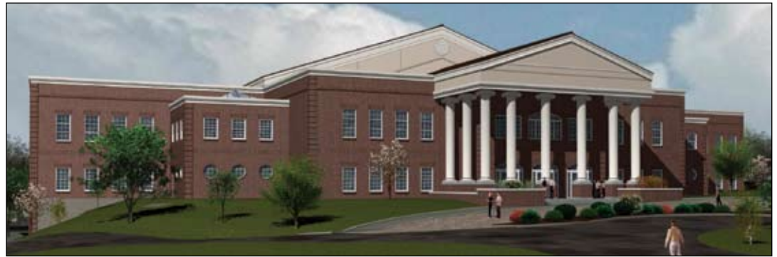
Rendering of the proposed student center